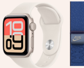
APPLE WATCH SE 3 GPS, 40MM STARLIGHT ALUMINIUM CASE WITH BLUE RIBBON NIKE SPORT LOOP