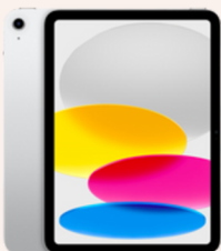
IPAD WIFI 128GB SILVER