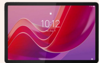
LENOVO 11IN WUXGA HELIO G88 4GB ARM MALI-G52 128GB SSD AND I3